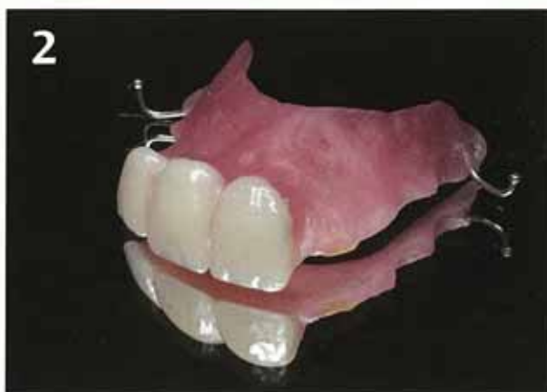
Figure 2 Tooth try-in for structure design

Most ceramists who have worked with previous generations of CoCr alloys remember a thick green oxide layer causing greening and cracking in ceramics under multiple firings. This excessively thick oxide layer also caused de-bonding between the opaque layer and alloy.