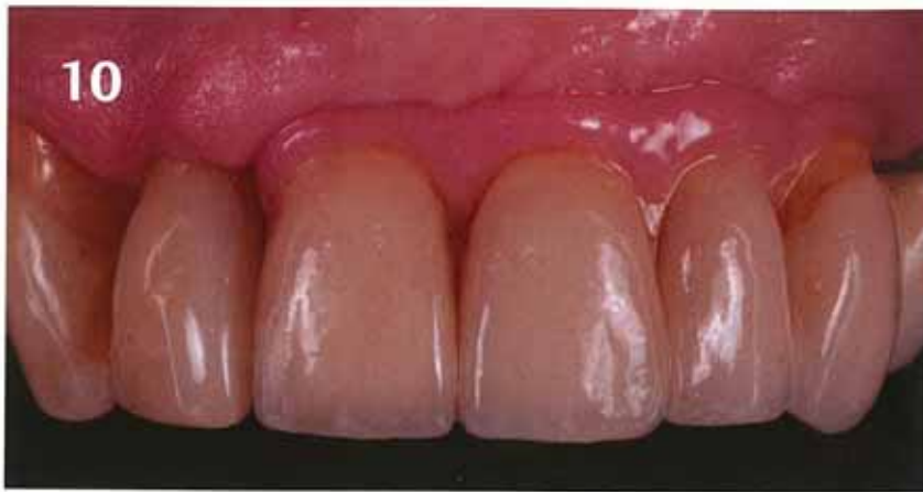
Figure 10 Pink tissue applied to create natural emergence, length and line angles