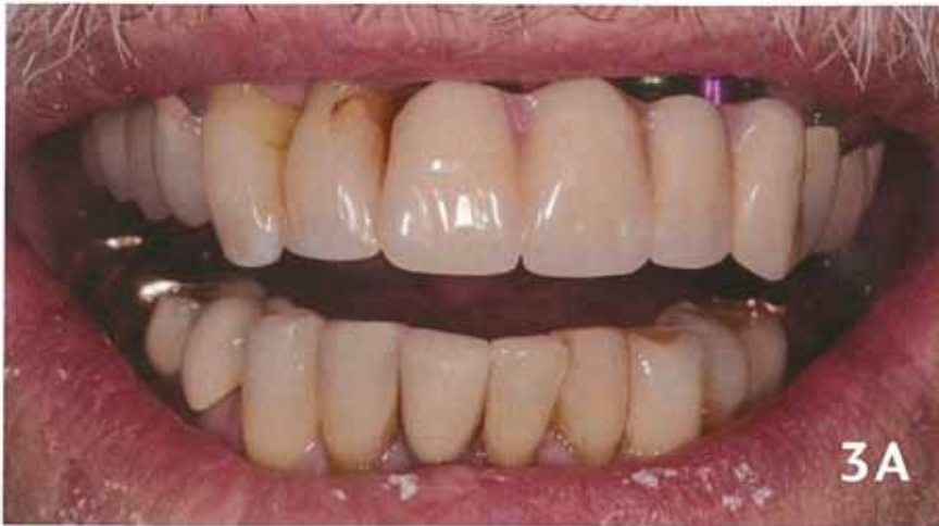
Figure 3A Diagnostic denture try-in