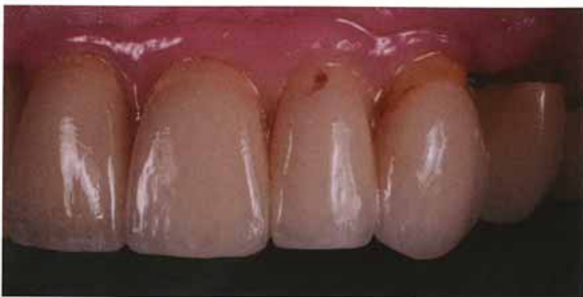
(Above) CoCr Fixed Partial

coronal length of the teeth (Figure 10). Pink tissue is also very helpful to control tooth emergence and line-angles influenced by implant positions. The first attempt (Figure 11) to restore this case was done without pink tissue, making control over the emergence and neck positions an esthetic challenge.