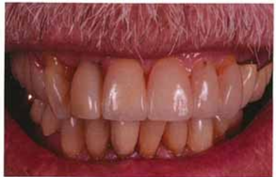
(Above) Post-op final