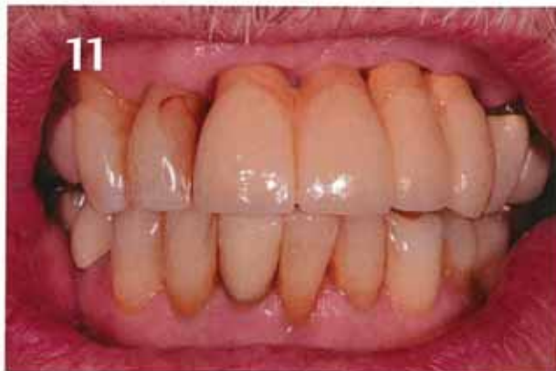
Figure 11 First attempt without pink tissue