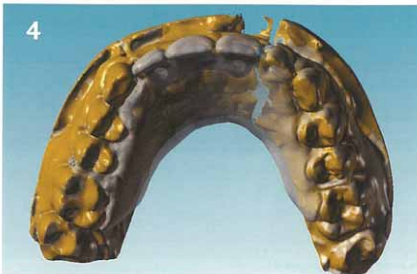
Figure 4 Digital dual scan for design

Optional metal framework try-in ( Figure 6 ) to verify model accuracy and fit. To reduce the possibility of internal connection implants